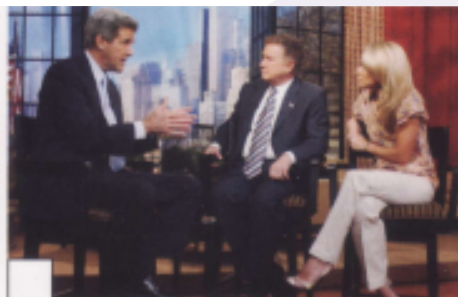
a talk show