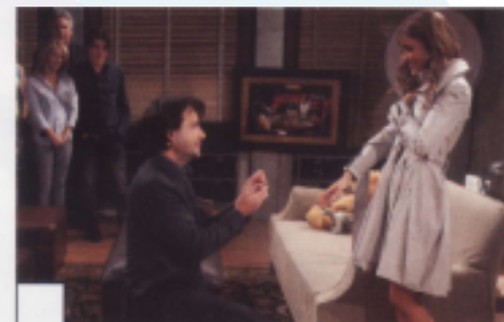
a soap opera