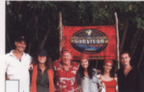
A reality show