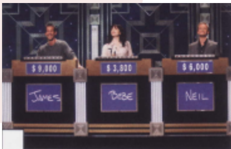
a game show